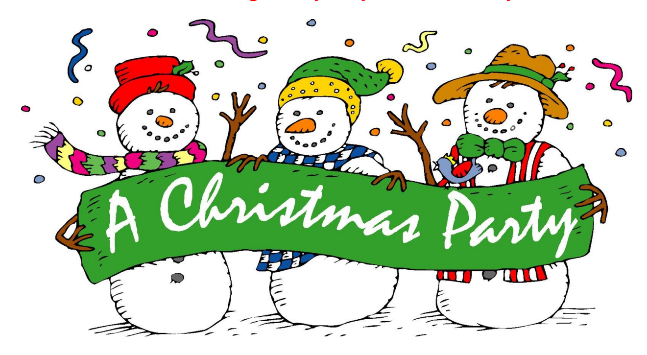
Join us on December 8, at 7pm for our Virtual Holiday Party!

We invite everyone to a fun -filled hour jammed pack with the Christmas Spirit, virtually!